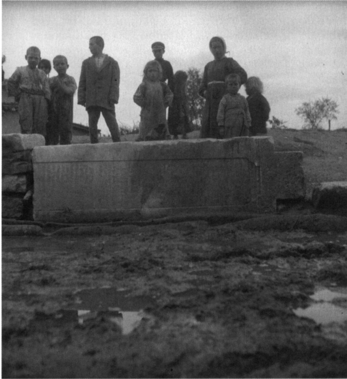
FIG. 1. Honorific stele for Tatia, daughter of Menokritos (İslâmköy: Akmoneia).

[ἀγαθῇ τύχῃ· αἱ γυ]- ναῖκες Ἑλληνί- δες τε καὶ Ῥωμαῖ- αι