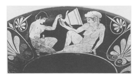
Fig. 3a: Los Angeles, California, J. Paul Getty Museum 80.AE.31; Attic red-figured kylix by Phintias, ca. 510 B.C..