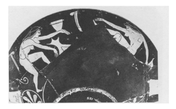
Fig. 4b: Paris, Louvre G 14 (photograph courtesy of the Louvre).