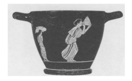
Fig 2: Los Angeles, California, J. Paul Getty Museum 86.AE.265; Attic red-figured skyphos, ca. 470–460 B.C..