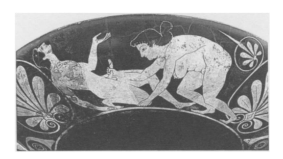
Fig. 3b: Los Angeles, California, J. Paul Getty Museum 80.AE.31; Attic red-figured kylix by Phintias, ca. 510 B.C..