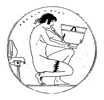
Fig 5: Once Paris, Pourtalès 388 (after G. Vorberg, Glossarium eroticum, p. 507).