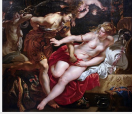
Women In Antiquity